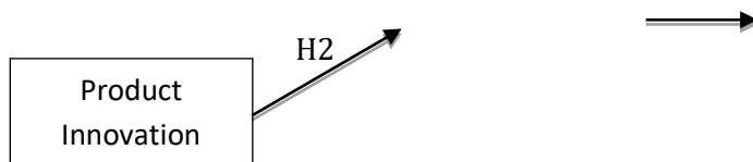
Figure 1. Research Graphic Models

H1 : Market orientation has a positive influence on competitive advantage in the performance of the market