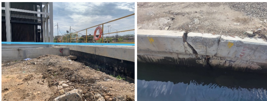
Figure 7. Structural damage and structural settlement

Events of structural damage and structural settlement are shown in Figure 7. It is the impact of the condition of soil movement during the construction phase. According to Castaldo et al., (2013) in their research damage to reinforced concrete structures can be affected by land subsidence due to excavations around the work site.