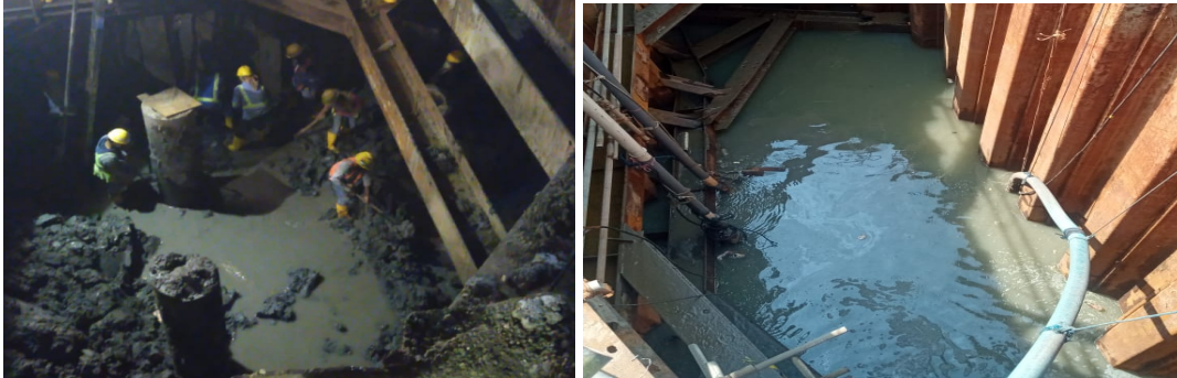
Figure 4. Existence of groundwater level

Changes in groundwater levels outside of normal seasonal variations are not considered while major changes can occur, such as a lack of groundwater pumping capacity which will cause the water level to rise, pooling in the lower construction area and tunnels, and can change the soil load Brassington, (1986) .