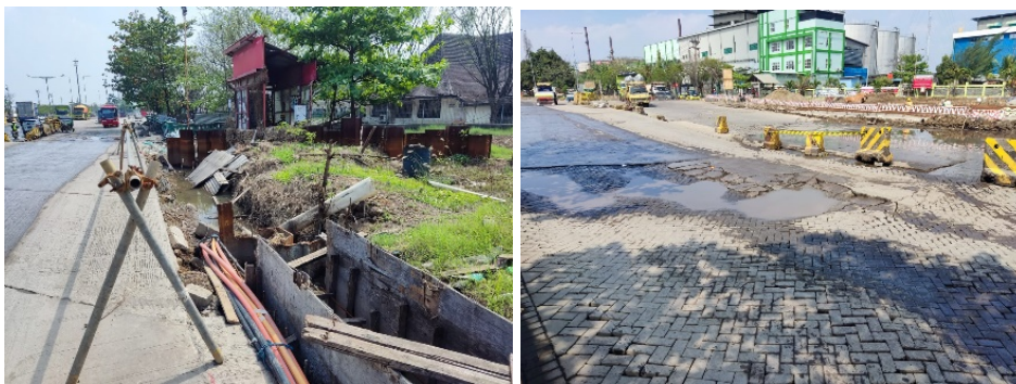
Figure 5. Damage to Infrastructure around the Site

The availability of infrastructure utilities is an advantage of the brownfield project and infrastructure damage is the responsibility of the contractor, as shown in Figure 5. Damage to drainage channels can cause water logging around the project site. Meanwhile, road damage causes discomfort for road users in industrial complex environments.