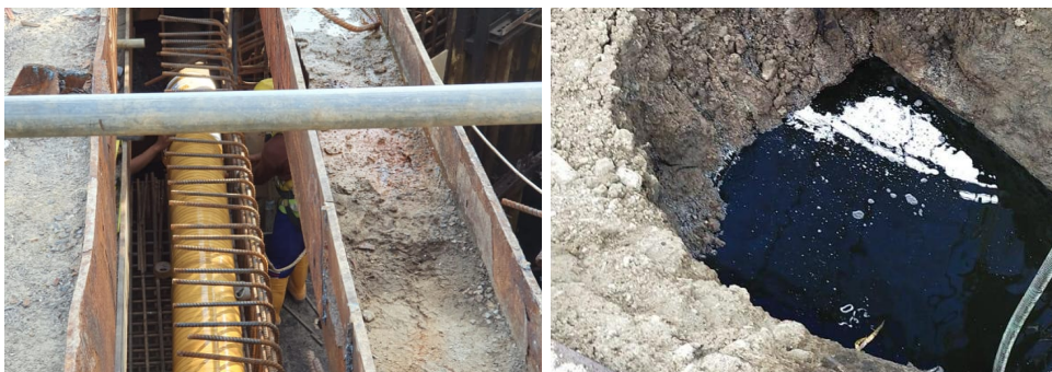
Figure 9. Existing pipe leakage

Leakage of existing pipelines containing fuel close to construction works can endanger the health of workers at the work site and can cause explosions and fires. Basically the brownfield project is carried out with the condition of the factory location still operating. It does not rule out the possibility of finding some underground services such as gas pipelines, fuel pipes and power lines. Field observations found risk events as shown in Figure 9.