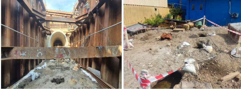
Figure 8. Creeping decrease in soil

This behavior occurs over a long period of time under constant stress of environmental conditions, Charles, (2008); Brink and Tinto, (2021)