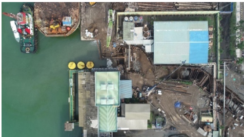
Figure 1. Case study location

Plant (BOP) which is a supporting building in a series of Power plant work processes, one of which is the Circulation Water Pump Station building which has the main function of pumping seawater which flows through concrete pipes to the condenser tubes. Then the water in the condenser tube is used to condense the low pressure (LP) output stream in the HRSG to drive a steam turbine. After the evaporation process is complete, the evaporating wastewater is processed at the Wastewater Treatment Plant and then discharged back into the sea through the Outfall network.