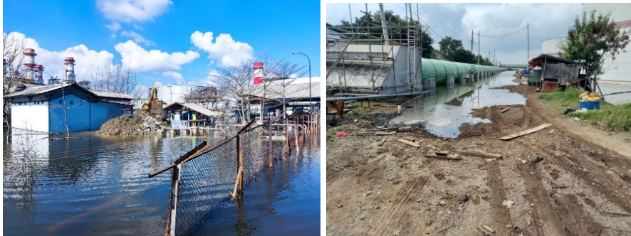
Figure 6. Surface water and tidal flooding

the location, intensity and duration of rainfall, soil surface characteristics and the design of surface drainage and sewer systems.